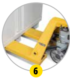
Moving by pallet truck (empty)