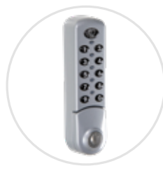
SERCODE code lock