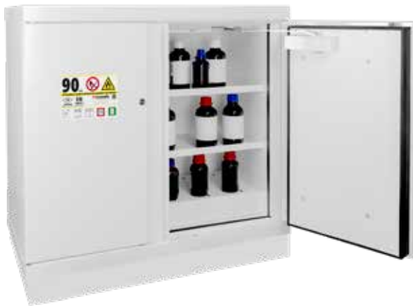
▲ 793+E + C35