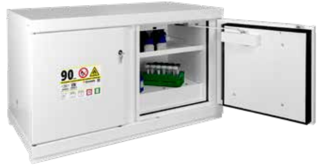
▲ 792+E + C2