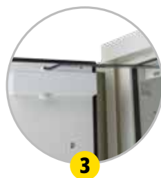
Self-closing door with thermo-fuse