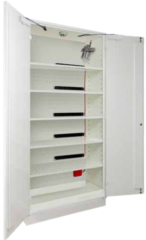
▲ S2004+LIA5 + 5 PRISELI + GL04 + 2 PEXTBALI50