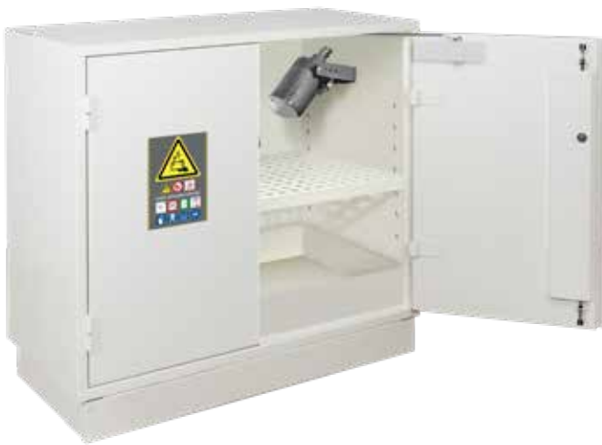
▲ S806+LIA1 + PRISELI + GL06 + PEXTBALI50

15 min Fire-resistant construction (from inside to outside) certified EI 15 min type A1, in accordance with standard NF EN 13501-1.