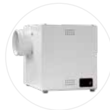
Ventilation box CDV-A (option)