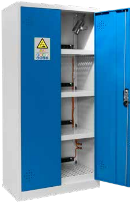
▲ AZ301BLI + 4 PRISELI14 + EX200LI + PEXTBALI14

Fume hoods, filtering cabinets - Ventilation Lithium-ion cabinets Flammable cabinets Corrosive cabinets Toxic cabinets and Multirisk Containment and cans File cabinets Anti-fire equipments Showers and first-aid equipments