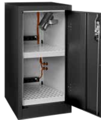
▲ AZ51NLI + 2 PRISELI + EX100LI + PEXTBALI14