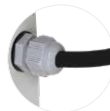
Cable management PEXTBALI14 (option included with PRISELI14)