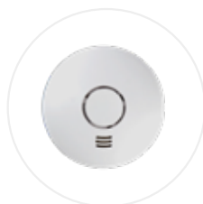
ALARMWI connected smoke detector (option)