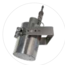
Fire extinguisher EX100LI/ EX200LI (option)