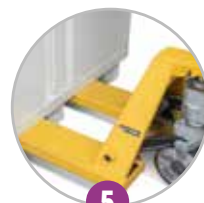
5 Moving by pallet truck