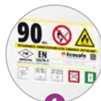
1 Standardized labeling